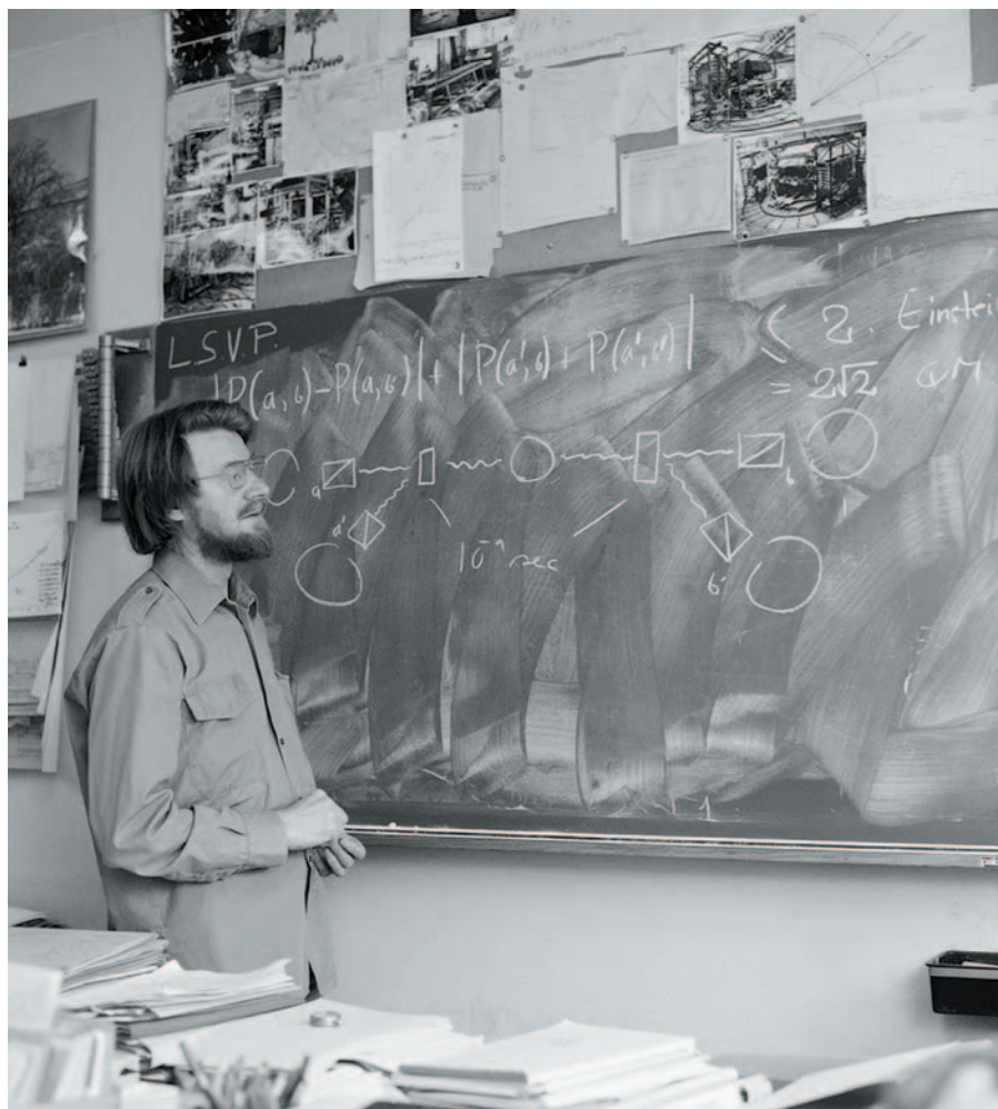
Physicist John Bell at CERN, Europe's particle-physics lab near Geneva, Switzerland, in 1982.