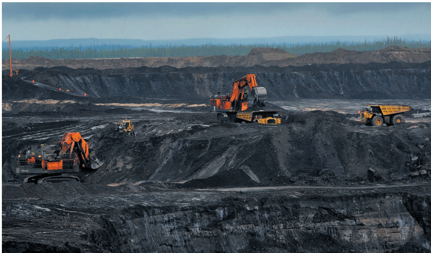
Oil extracted from fields in Alberta, Canada, would travel through the proposed Keystone XL pipeline.